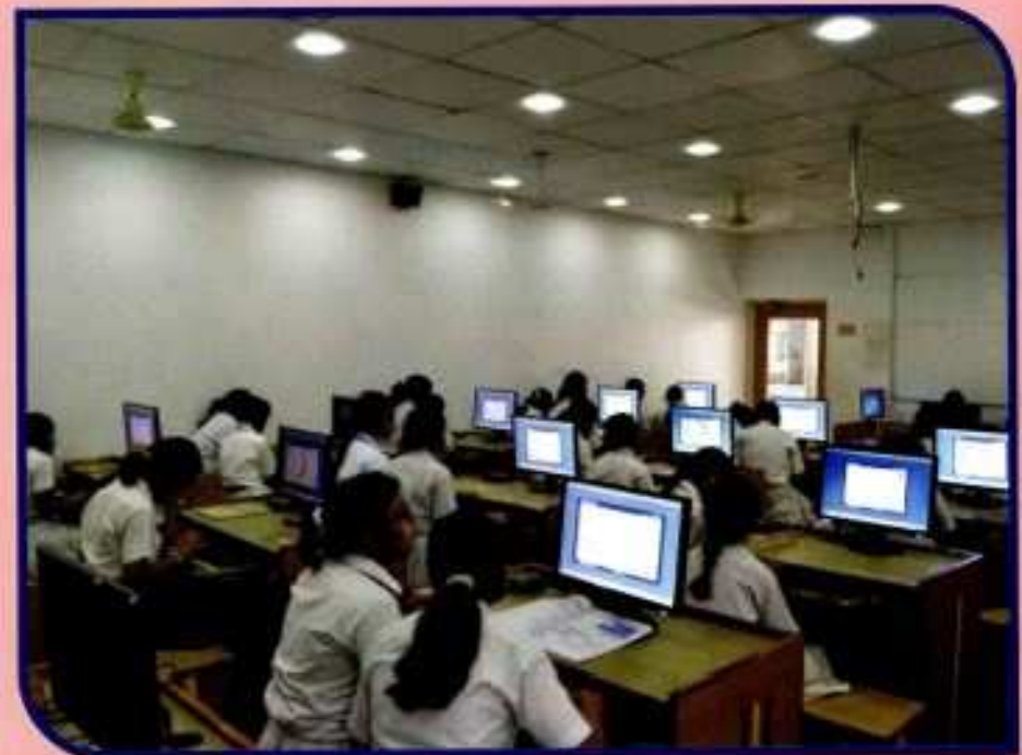
Students doing the practicals in the computer lab

To keep pace with the scientific advancement and with the aim of making education hi-tech, the two multimedia Computer labs consisting of student Management Features of Net support provide full control on students' desktop. The lab is controlled by two servers consisting of 20 nodes. Web control, application control, desktop management, file sharing etc. are managed on the server's desktop.