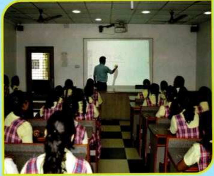
Students in seminar

'Conscientia' Audio/video lab with interactive projector provides opportunity of sharing the information by different users at different locations and is ideal for conducting seminars and various student-teacher enrichment programmes.