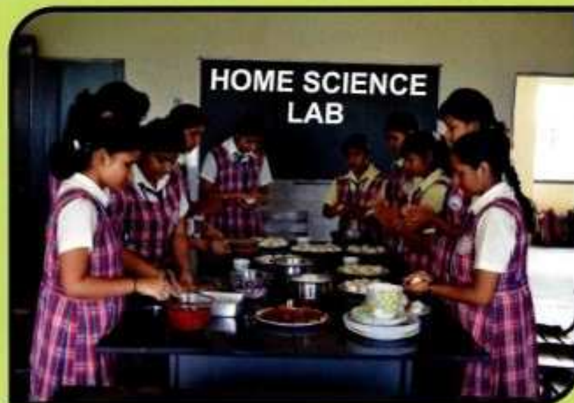
Students engaged in Home Science Lab

A Home science graduate may end up working as a counsellor, dietician or teacher. They are also preferred in N.G.O.'s as they understand human Psyche. Dhanbad Public School provides the wonderful opportunity of taking Home Science as an optional subject. It is a purely academic science course.