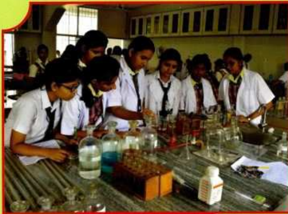
Students experimenting in Chemistry

Experiments done in Chemistry lab help the students to have a deeper insight into the subject and offer an ambience of creativity & invention.