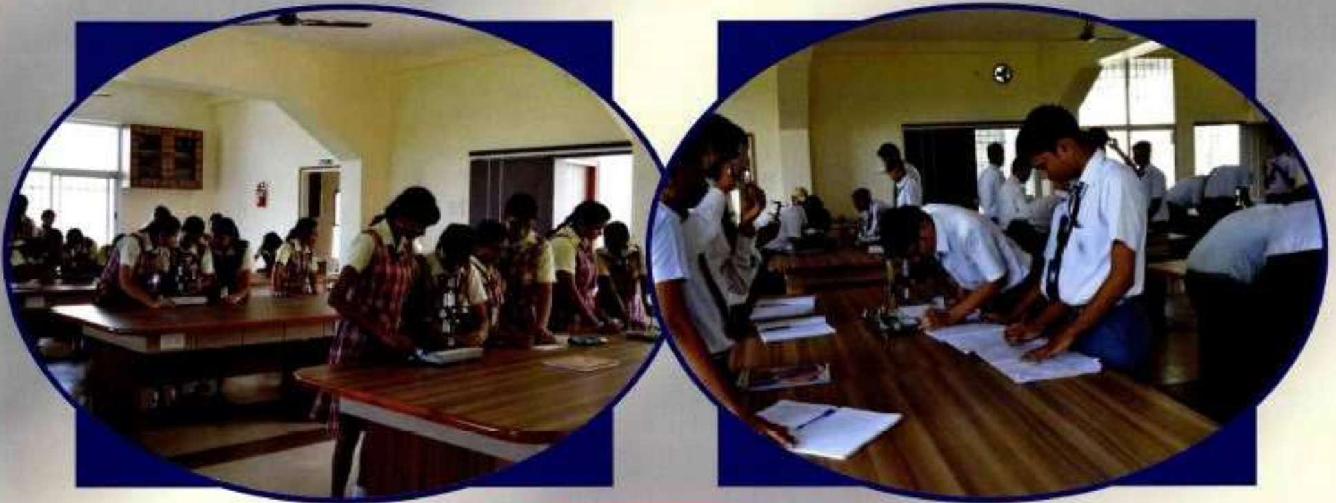
STUDENTS IN PHYSICS LAB

In the well equipped & sophisticated Physics lab, the students learn to believe in justification by verification.