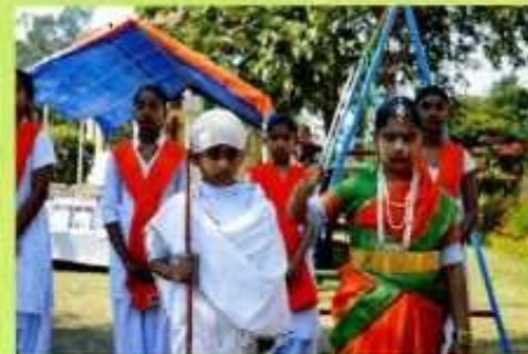
UDAAN - Hindi Club