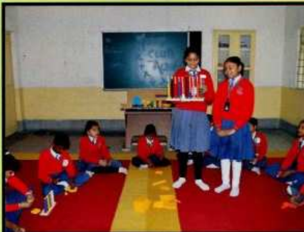
GOLDEN RECTANGLE - Maths Club