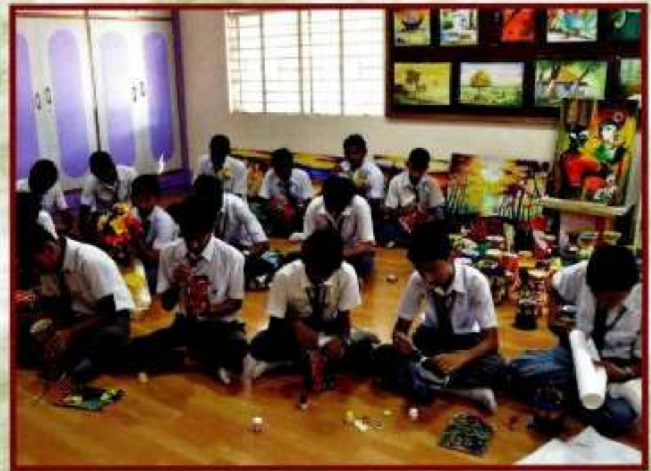
Students in the Art Studio

The furniture is maintained and renovated on regular basis by the Fine Arts Department to capture and retain the interest of the students.