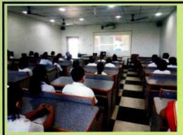
FLUENT MINDS - Reading Club