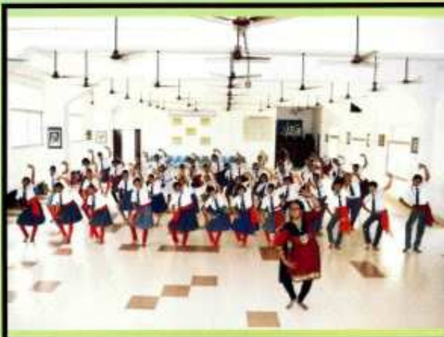
NRITYAM - Dance Club