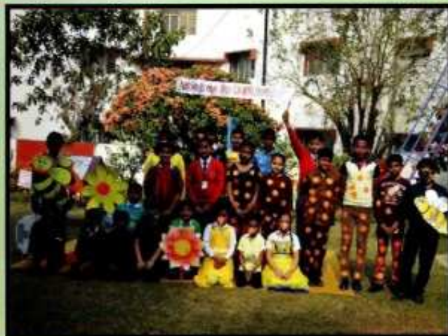
HARIYALI - Eco Club