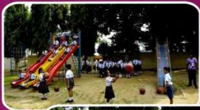
Girls Block Junior Wing

This is organised as a separate preparatory school with its own self contained building and ground.